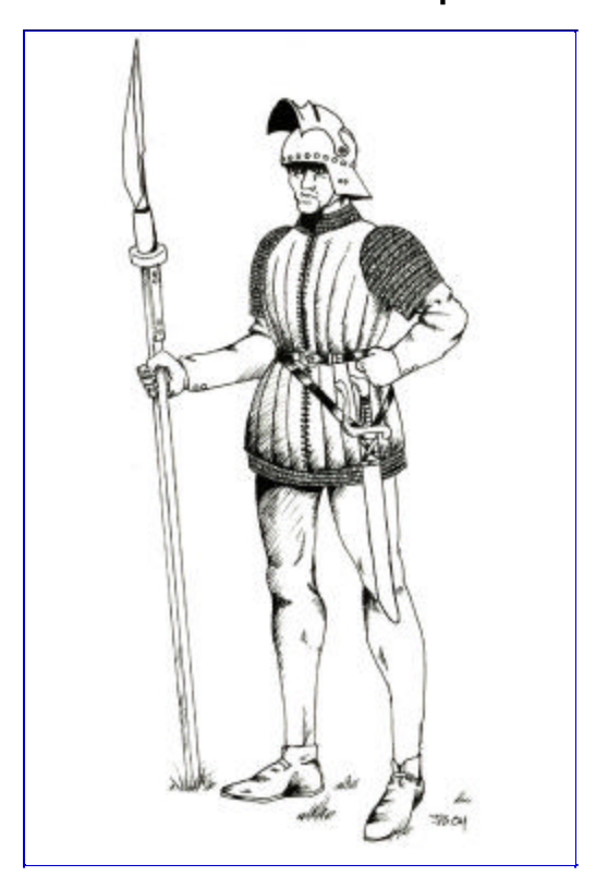
Cover art by Lord James de Biblesworth

This is Volume 13 #4 of II Tempo (The Times). II Tempo is provided at no charge online and in <u>PDF format</u> on the Baronial web site. Any member of the Barony of Ponte Alto who does not have Internet access may request a printed copy of II Tempo at no charge. Please notify the <u>Baronial Chronicler</u> if you require a printed copy.