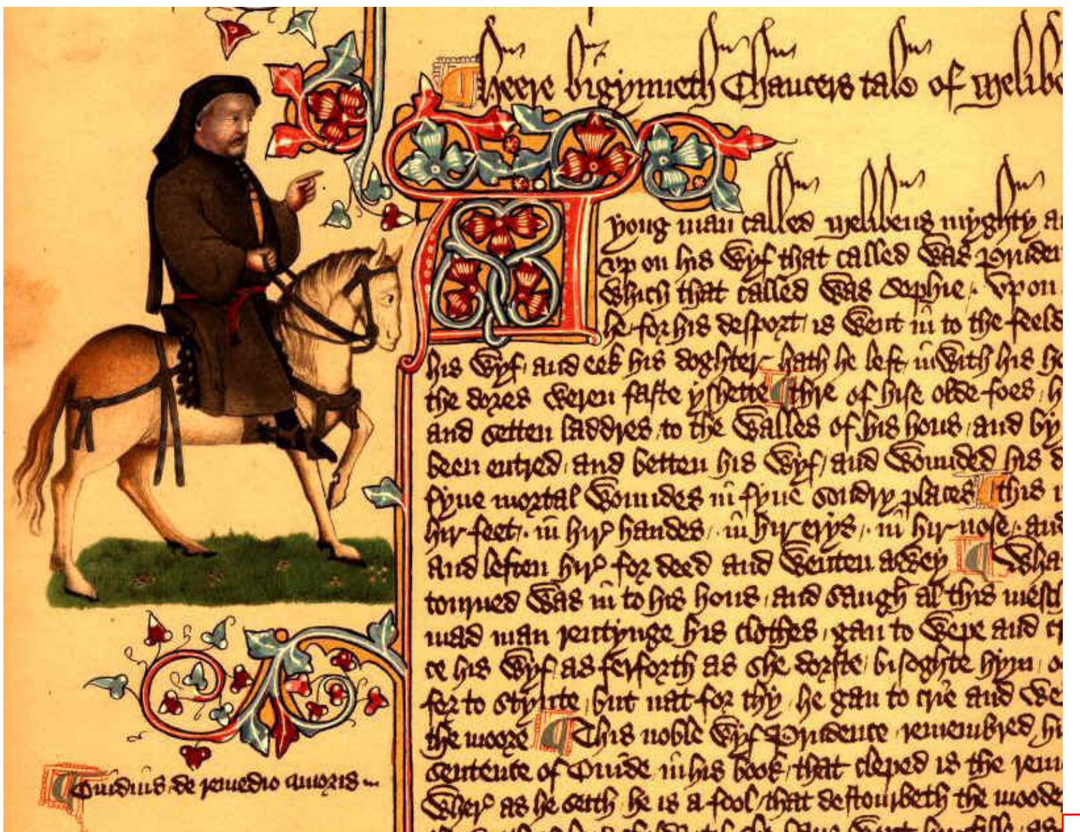
Portrait of Chaucer as a Canterbury pilgrim, Ellesmere manuscript of The Canterbury Tales . (The two-dimensional work of art depicted in this image is in the public domain in the United States and in those countries with a copyright term of life of the author plus 100 years.)

This is Volume 14 #8 of Il Tempo (The Times). Il Tempo is provided at no charge online and in PDF format on the Baronial web site. Any member of the Barony of Ponte Alto who does not have Internet access may request a printed copy of Il Tempo at no charge. Please notify the Baronial Chronicler if you require a printed copy.