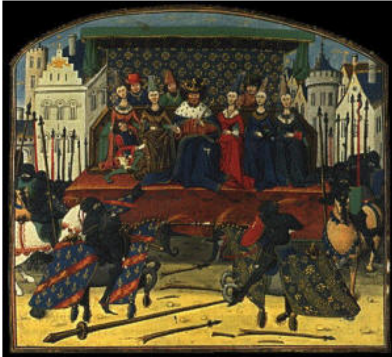
Cover art provided as part of public domain

This is Volume 14 #5 of II Tempo (The Times). II Tempo is provided at no charge online and in PDF format on the Baronial web site. Any member of the Barony of Ponte Alto who does not have Internet access may request a printed copy of II Tempo at no charge. Please notify the Baronial Chronicler if you require a printed copy.