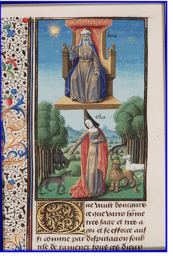
Janus on his throne (the celestial god or sky) and Tellus (terrestrial goddess or earth) between animals. Maître François (illuminator). Currently on display at The Hague.

The Chinese New Year, also known as the Lunar New Year, occurs every year on the new moon of the first lunar month, around the beginning of spring (Lichun). The exact date can fall anytime between 21 January and 21 February (inclusive) of the Gregorian Calendar. Because the lunisolar Chinese calendar is astronomically defined, unlike the Gregorian Calendar, the drift of the seasons will change the range. Each year is symbolized by one of 12 animals and one of five elements, with the combinations of animals and elements (or stems) cycling every 60 years. It is the most important Chinese holiday of the year.