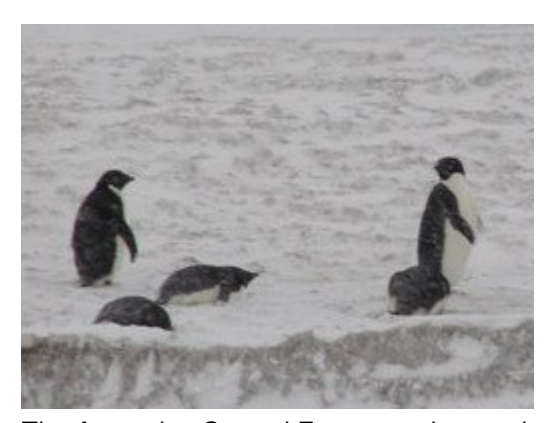
The Antarctica Ground Forces getting ready for their Annual Ice-Cream Social and Mating Soireé.