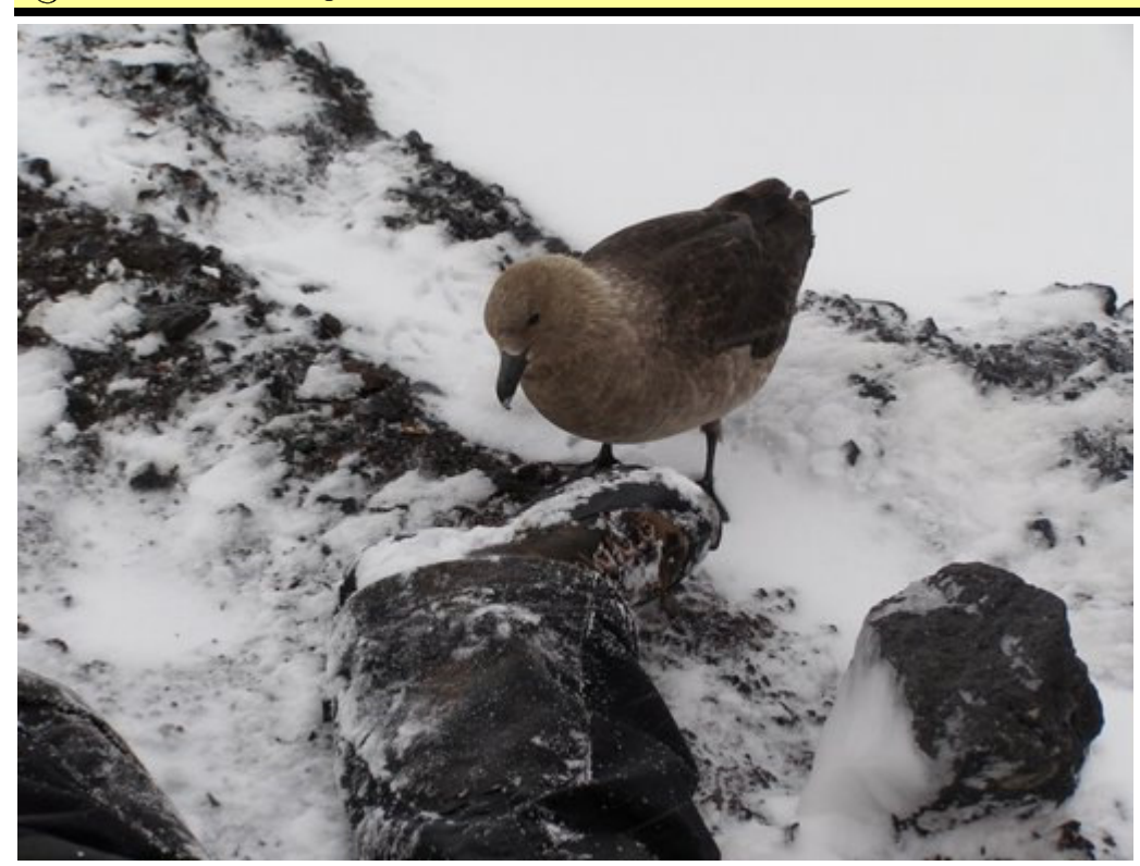
Yum! Those sneakers look like a Big Whopper! Or spaghetti! Definitely spaghetti!