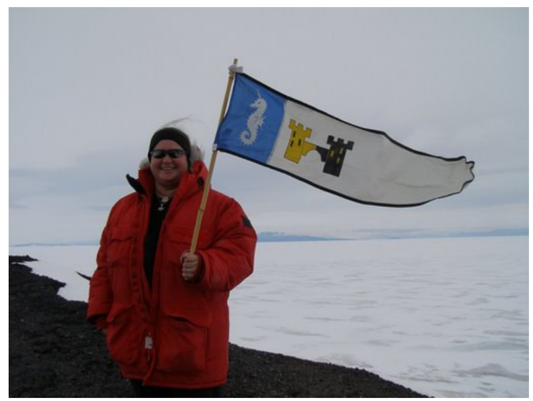
The Ponte Alto Elite Forces Commander proudly displaying the Baronial Banner