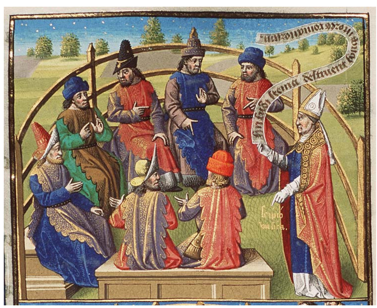
Scipio Nasica (dressed as a bishop) discussing theatrical performances of plays in honor of the Roman gods with a group of scholars. Maître François (illuminator)

Newsletter of the Barony of Ponte Alto-Volume 17, Issue 2₺ February 2008