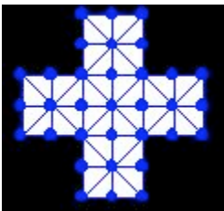
Fox and Geese board