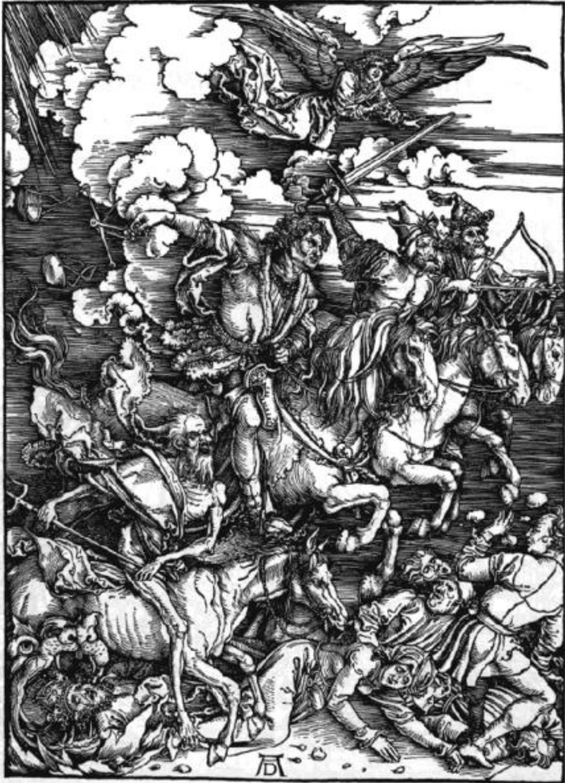
Dürer's Four horsemen of the Apocalypse