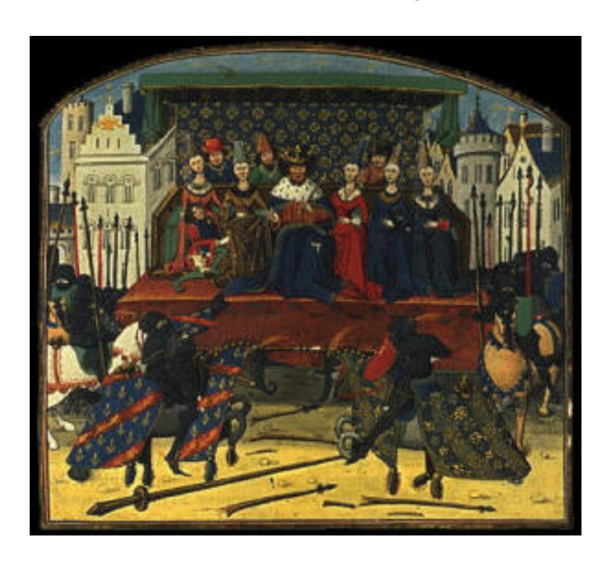
Cover art provided as part of public domain

This is Volume 14 #5 of II Tempo (The Times). II Tempo is provided at no charge online and in <u>PDF format</u> on the Baronial web site. Any member of the Barony of Ponte Alto who does not have Internet access may request a printed copy of II Tempo at no charge. Please notify the <u>Baronial Chronicler</u> if you require a printed copy.