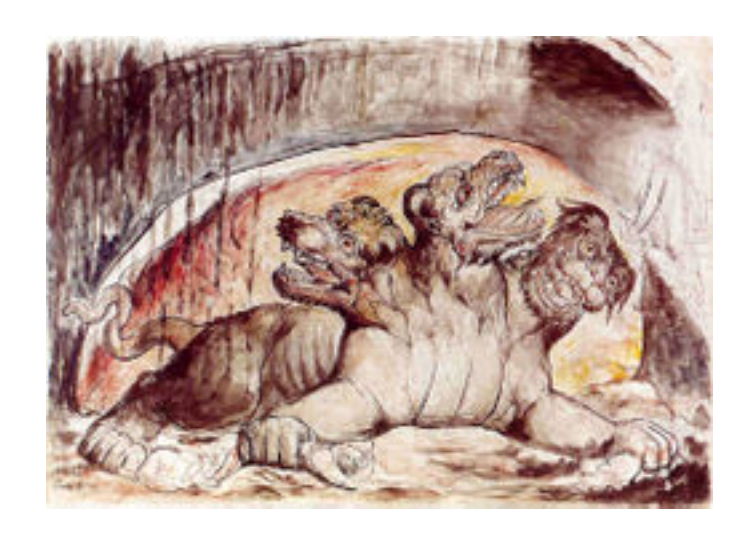
Cerberus, by William Blake

The two-dimensional work of art depicted in this image is in the public domain in the United States and in those countries with a copyright term of life of the author plus 100 years. This photograph of the work is also in the public domain in the United States (see Bridgeman Art Library v. Corel Corp.).