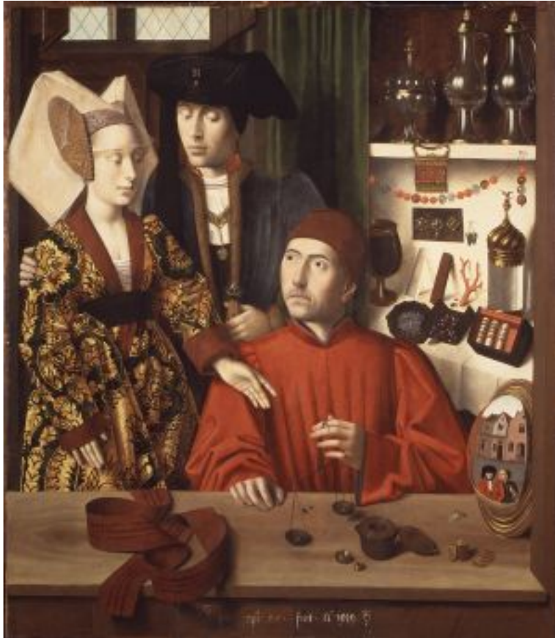
A Goldsmith in His Shop, Possibly Saint Eligius, 1449. Petrus Christus (Netherlandish, active by 1444, died 1475/76)

The two-dimensional work of art depicted in this image is in the public domain in the United States and in those countries with a copyright term of life of the author plus 100 years. This photograph of the work is also in the public domain in the United States (see Bridgeman Art Library v. Corel Corp. ).