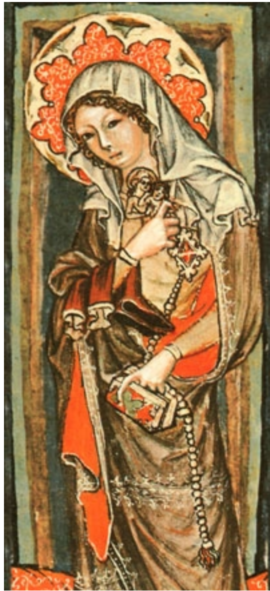
Linear paternoster. "St. Hedwig", c.1300s.

Paternosters were considered personal jewelry but because they were religious in nature, they were often exempt from sumptuary laws. One could show off one's wealth without fear of retribution and display one's piety at the very same time. People wore their beads hanging from a girdle, wrapped around their wrist or arm, attached by a brooch to the breast, and sometimes even around the neck.