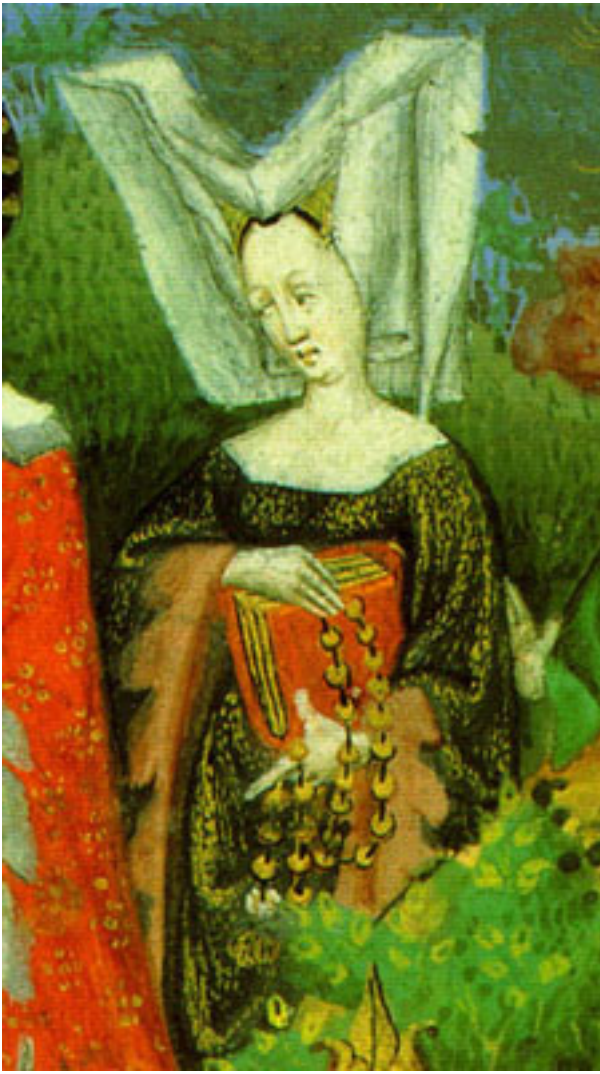
Loop paternoster. Bedford Master: The Bedford Hours "The Legend of the fleurs de lys (f. 288b). London, British Library, c.1430.