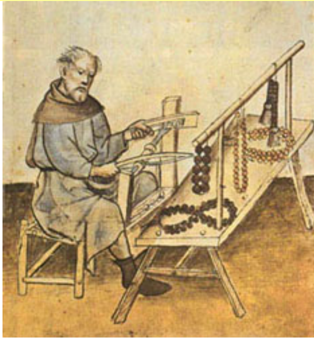
"Paternosterer," from the Hausbuch der Mendelschen Zwölfbrüderstiftung (Stadtbibliothek Nürnberg, Amb. 317.2, f.93v)

"paternoster beads" throughout the Middle Ages, most likely from the orders for reciting the Pater Noster prayer. The Ave Maria did not become a devotional formula until the mid-twelfth century. Around 1200, Anchoresses were guided to recite thirty Pater Nosters, each followed by an Ave Maria. Throughout the thirteenth century, Ave Maria became the more popular prayer until Dominic of Prussia (1382-1461) created the nearly-modern rosary of linking ten Aves with one of the fifteen mysteries of the Virgin, followed by one Pater Noster after each ten Aves.