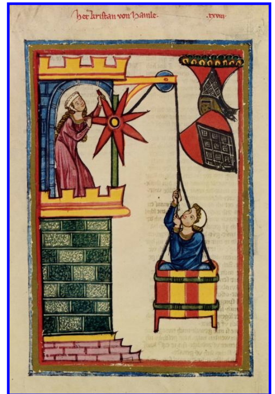
Kristan von Hamle (medieval Lovers, pulled in a basket)

The term "Courtly Love" was first popularized by Gaston Paris in his 1883 article "Attudes sur les romans de la Table Ronde: Lancelot du Lac, II: Le conte de la charrette, a treatise inspecting Chretien de Troyes's Lancelot, the Knight of the Cart (1177). Paris said amour courtois was an idolization and