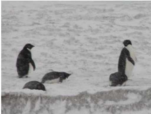
The Antarctica Ground Forces getting ready for their Annual Ice-Cream Social and Mating Soirée.