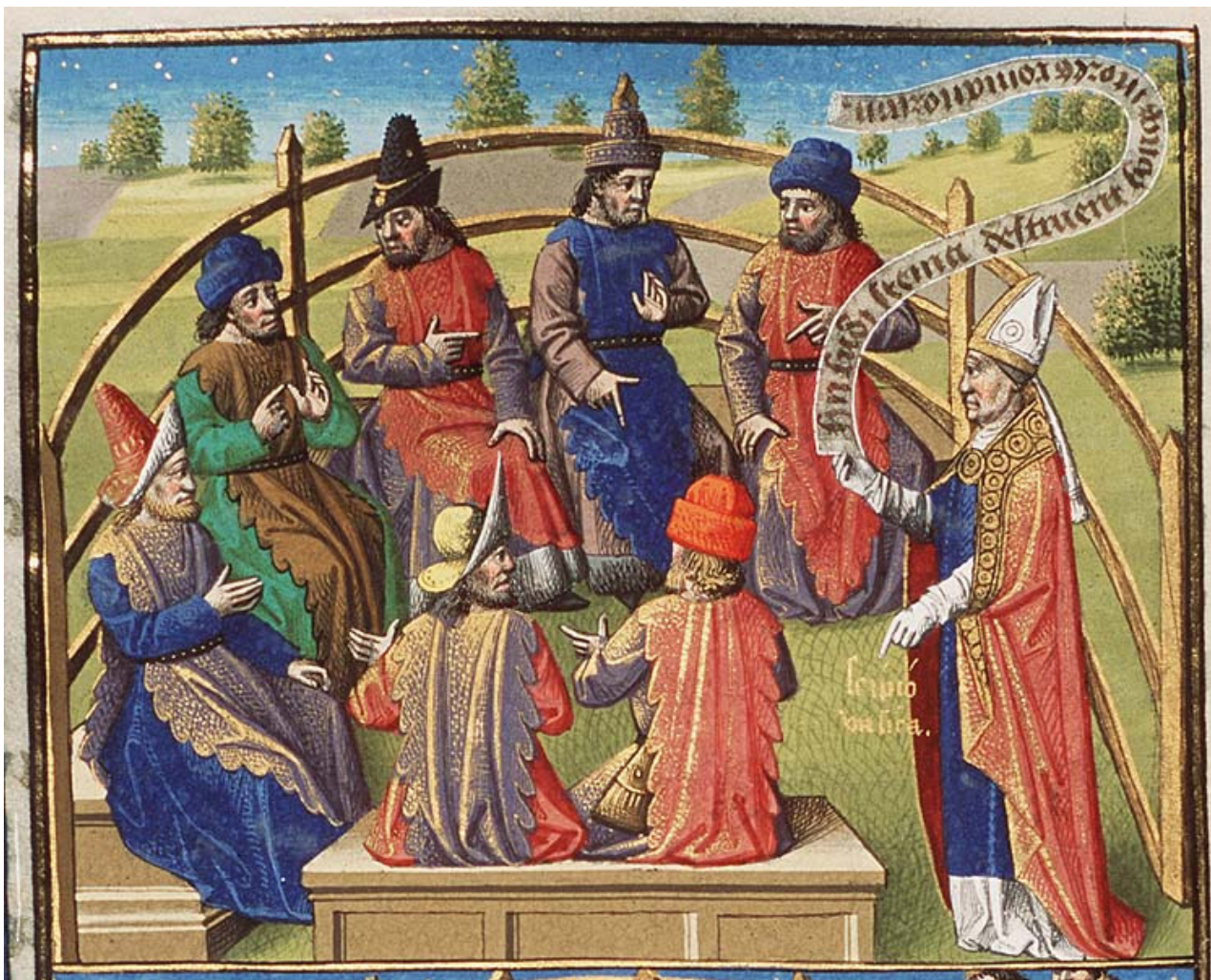
Scipio Nasica (dressed as a bishop) discussing theatrical performances of plays in honor of the Roman gods with a group of scholars. Maître François (illuminator)