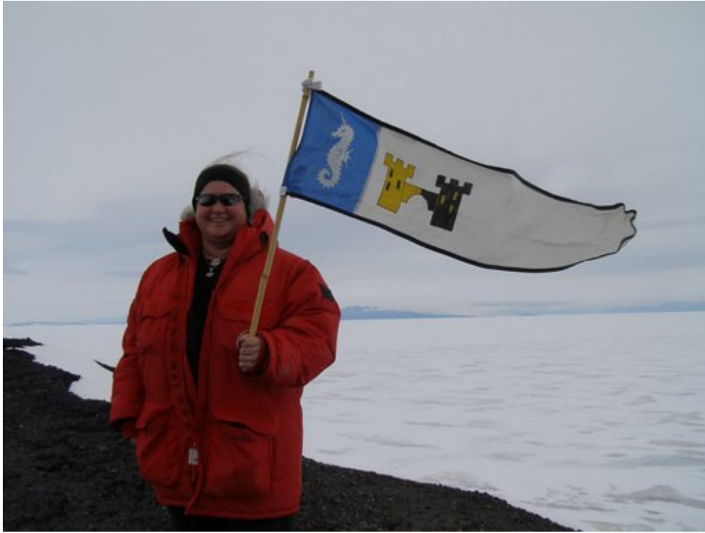
The Ponte Alto Elite Forces Commander proudly displaying the Baronial Banner