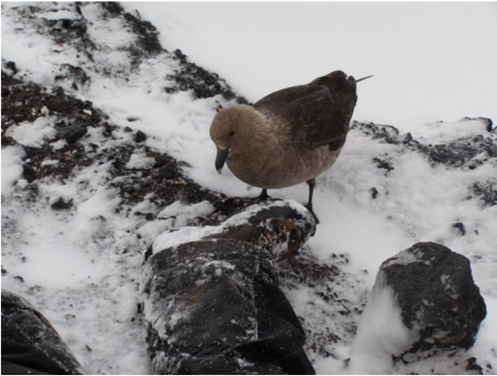
Yum! Those sneakers look like a Big Whopper! Or spaghetti! Definitely spaghetti!