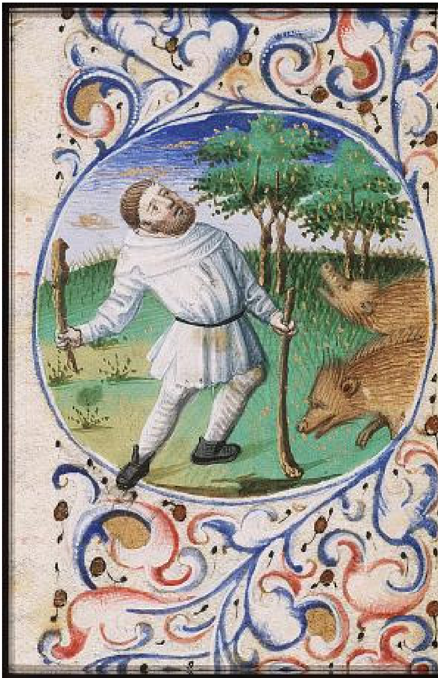
Calendar, November: a man knocking acorns out of oak-trees, Master of Jean Rolin II(illuminator). In the Hague