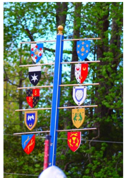
Arms of entrants in the Tournament of the Golden Rose.