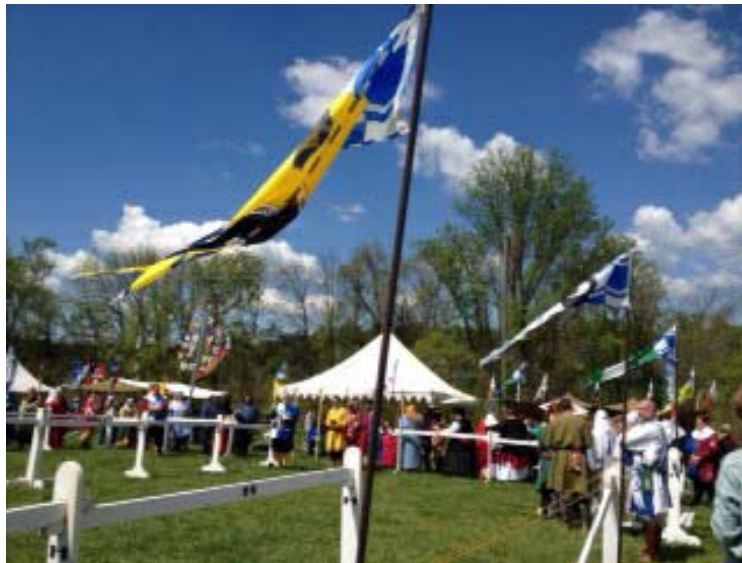
List field at Spring Crown Tournament 2015.