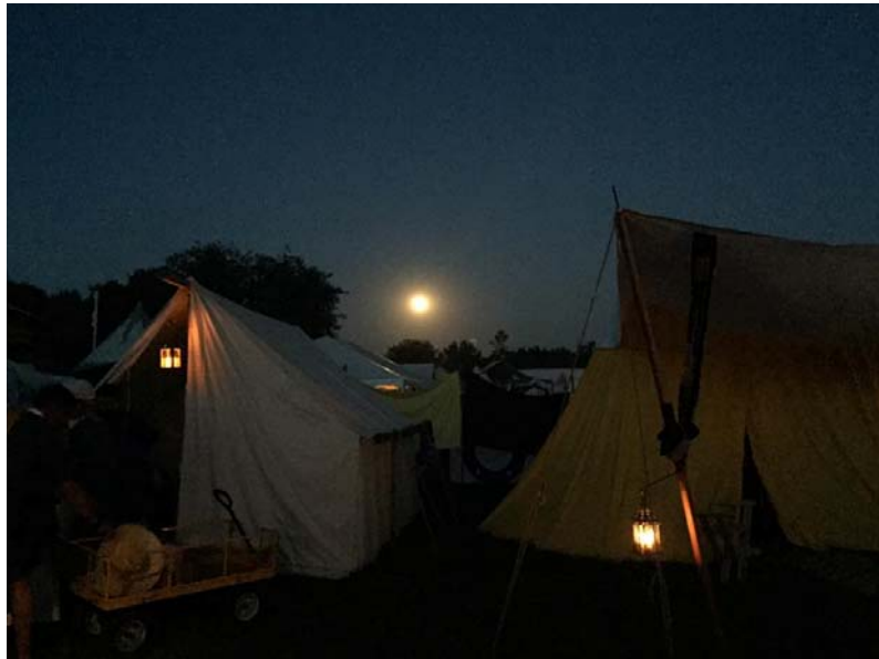
Moonlight over the Barony's encampment at Pennsic 44.