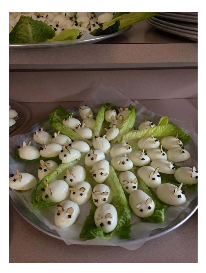
There were a few guests at Brunch with the Bards!