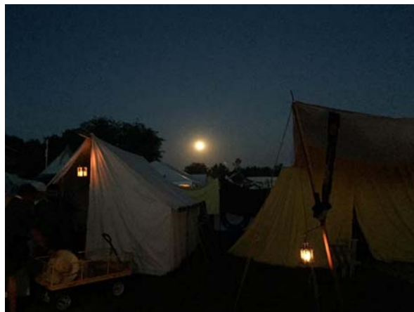
Moonlight over the Barony's encampment at Pennsic 44.