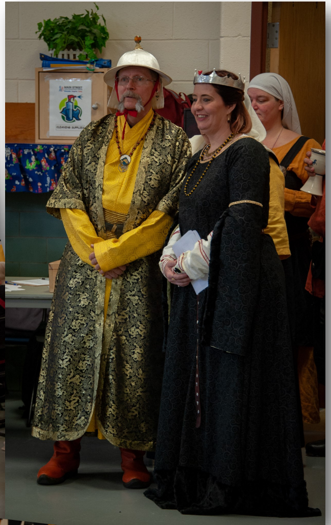
A final skip down the aisle, and the new Noyon and Baroness take on the mantle.