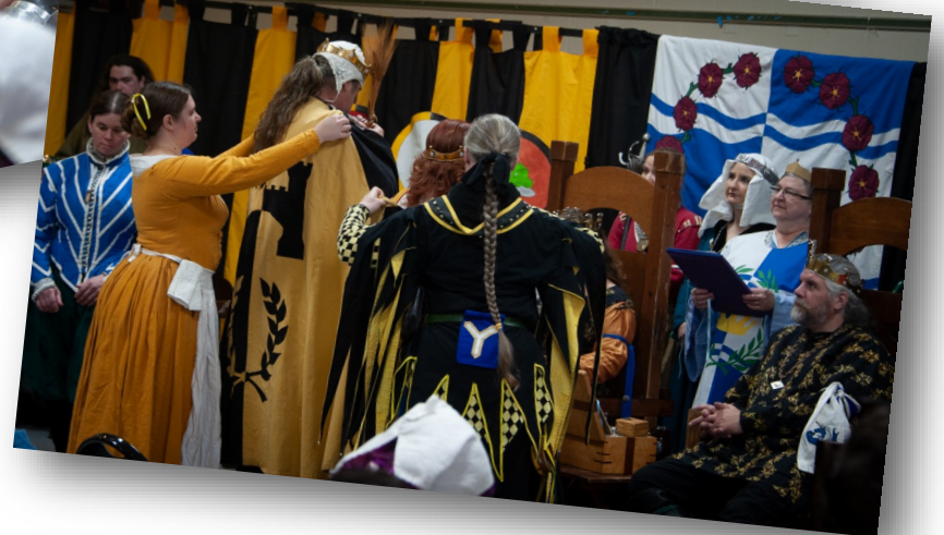
A final court, and a last chance to recognize folks before stepping down.