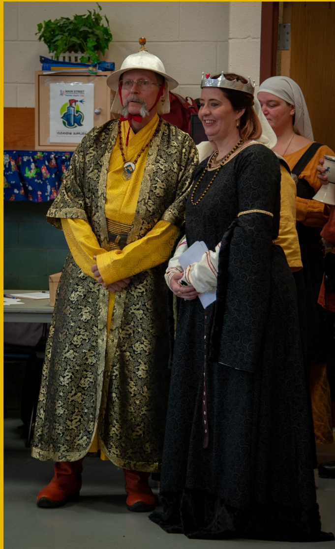
NOYON AND BARONESS TO BE PREPARING TO ENTER COURT PONTE ALTO INVESTITURE 2019

This is Volume 28, Issue 3, of Il Tempo (The Times), a publication of the Barony of Ponte Alto, in the Kingdom of Atlantia, of the Society for Creative Anachronism, Inc. Il Tempo is provided at no charge online and in PDF format on the Baronial website. Any member of the Barony of Ponte Alto who does not have internet access may request a printed copy of Il Tempo at no charge from the Baronial Seneschal ( seneschal@pontealto.atlantia.sca.org ).