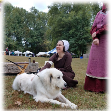
All photos courtesy of Rónán mac Ímair from 2020 Celebration of Yule