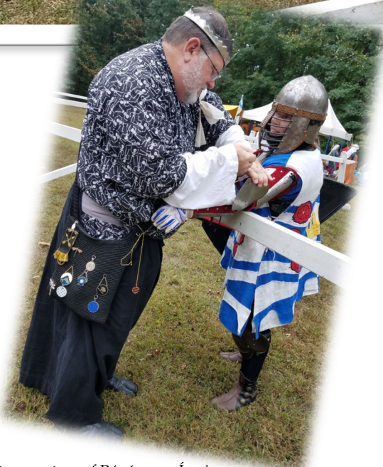
from 2020 Celebration of Yule