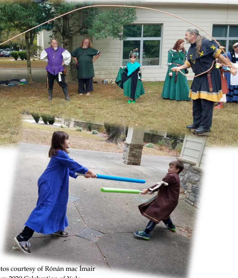
All photos courtesy of Rónán mac Ímair from 2020 Celebration of Yule