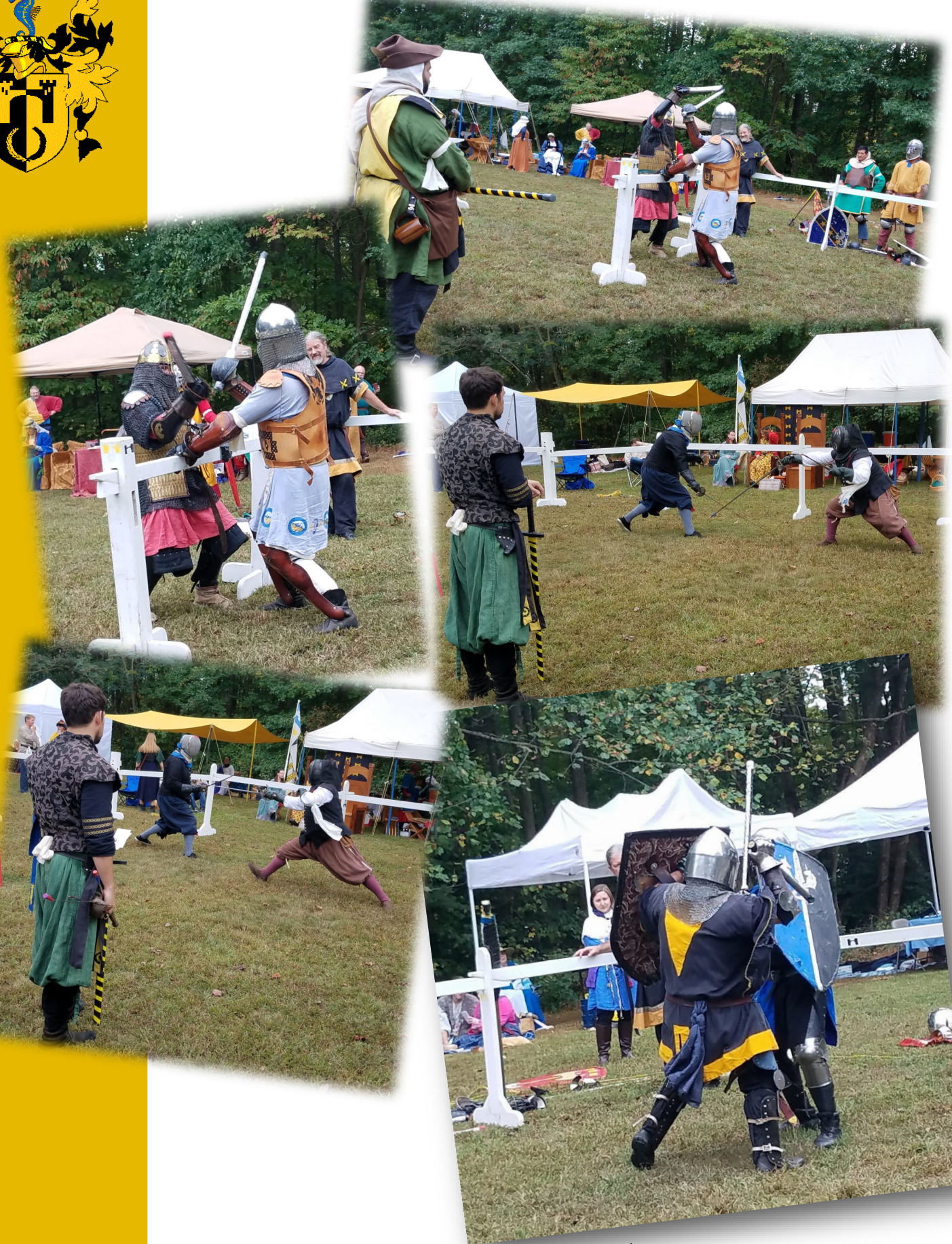
All photos courtesy of Rónán mac Ímair from 2020 Celebration of Yule