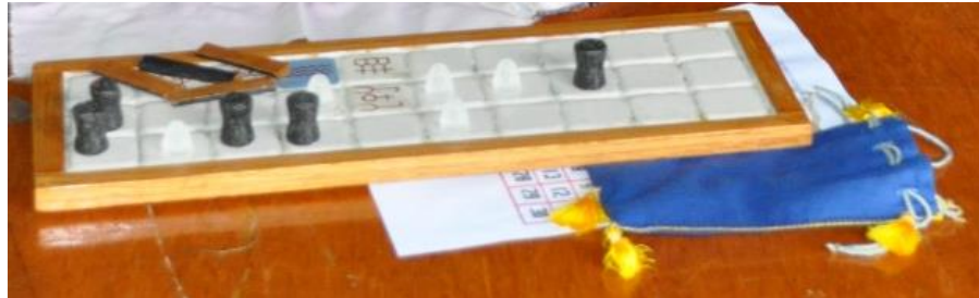
Figure 1. Senet with throwing sticks, cones, and reels. Photo and board by author.

Although we've covered games from around the world in this intermittent series, we haven't yet travelled to Ancient Egypt. Both senet and the game played by Pharaoh and Nefretiri in the movie "The Ten Commandments" have roots in Egypt and boards have been excavated in locations outside the Nile valley. Both also share the use of two-color throwing sticks rather than dice. Cast four sticks and count the light/flat sides. However, if all the sticks land dark/rounded side up the count is 6.