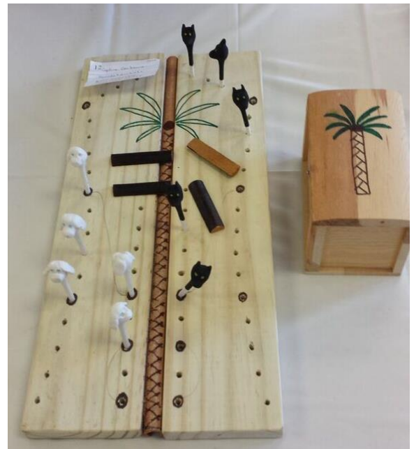
Figure 2. Hounds and Jackals board.

This game was named by archeologists and has only speculative rules. It appears players stay in their lane in this race game. This board was made in 2013 and recently published research suggests a few features are missing. If you care to dive deeper, here are some suggested starting points as well as the bibliography in the Wikipedia article