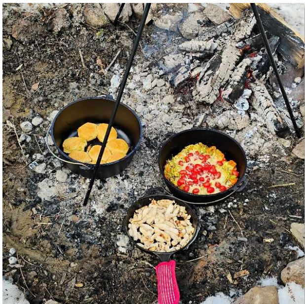
The finished product: cheese tortellini, chicken slices to top the pasta, and perfectly baked hot biscuits.