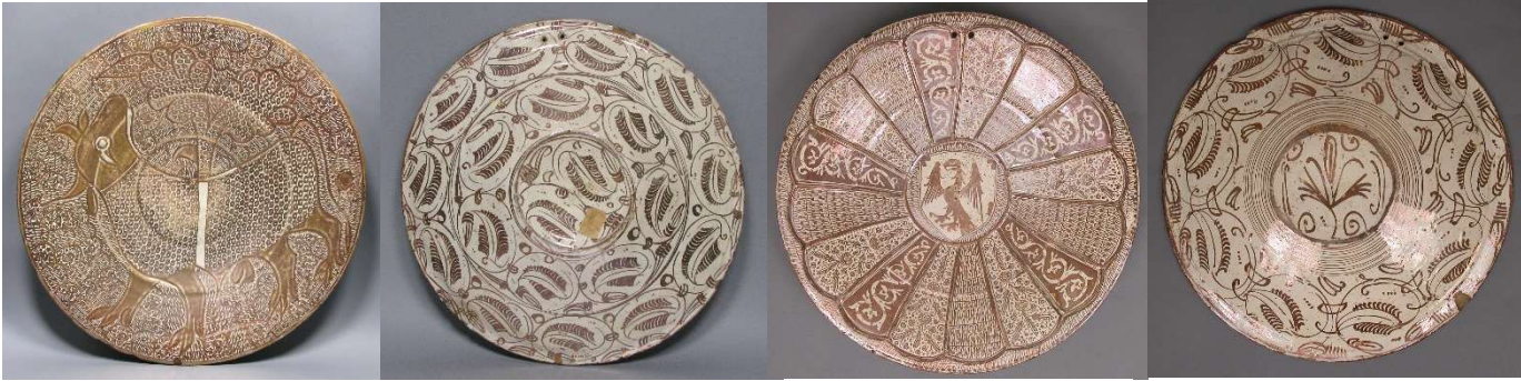
Spanish-late 15th–early 16th century