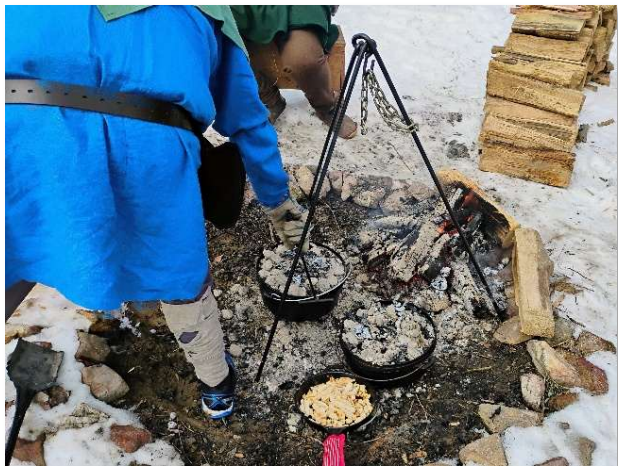
Křišťan, the camp chef at work with Dutch Ovens and cast-iron skillet. Note the fire to the top right, which kept hot coals at the ready.

experimenting with a brand-new Dutch oven – managed his coal placement effectively, and baked perfectly light and fluffy homestyle biscuits to accompany the tortellini.