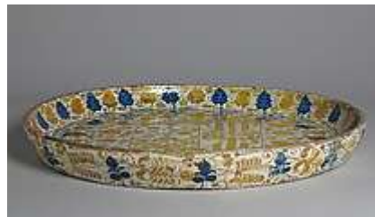
Plate with the Arms of Blanche of Navarre