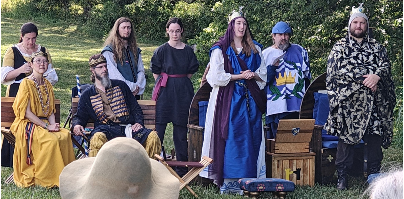
Afternoon Royal Court at 2026 Victory on the Vine.