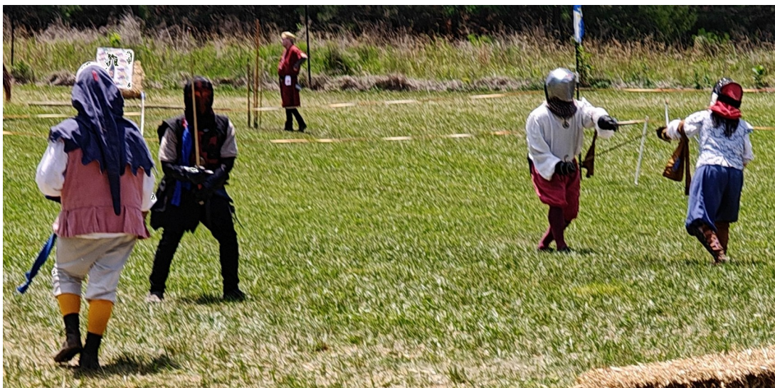
Rapier fights at 2026 Victory on the Vine.