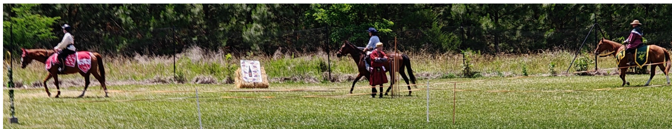
Equestrian at the 2026 Victory on the Vine.

On Saturday June 20 th , on a warm Summer day. In Culpeper Virginia, about 300 people descended on the fields of honor to participate in martial activities, arts and sciences, and general comradery. There were melees in both armored and rapier combat, target archery, siege combat, thrown weapons, and arts and sciences displays. The evening was capped off by a performance by DragonSong.