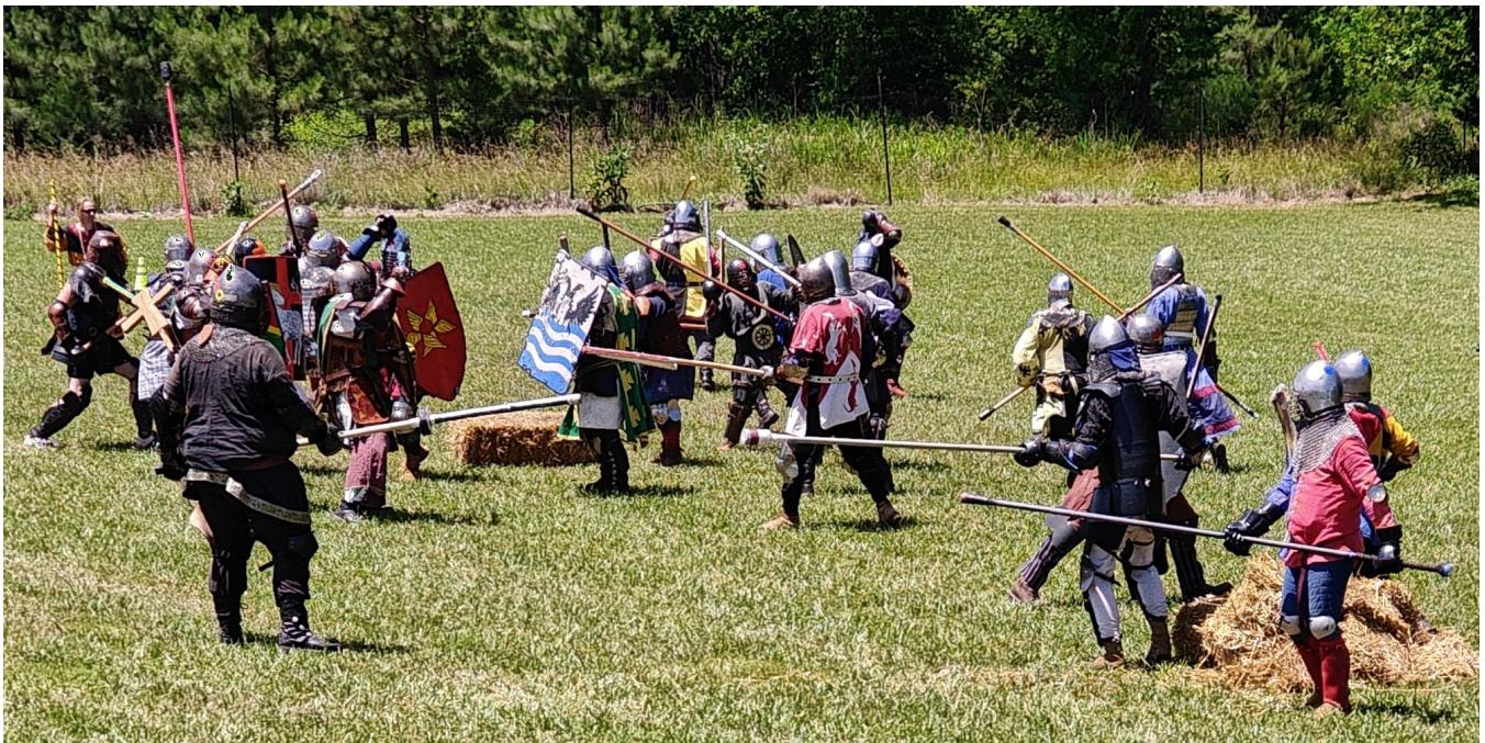
2026 Victory on the Vine Armored Melee