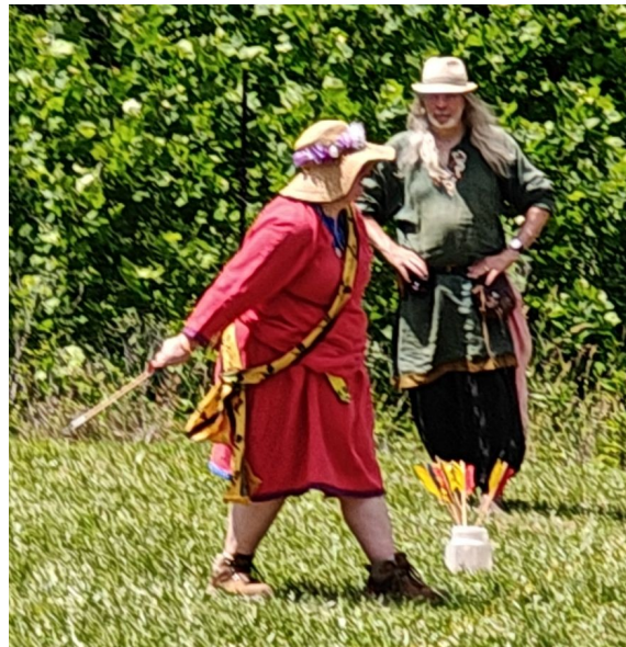
Thrown Weapons at 2026 Victory on the Vine