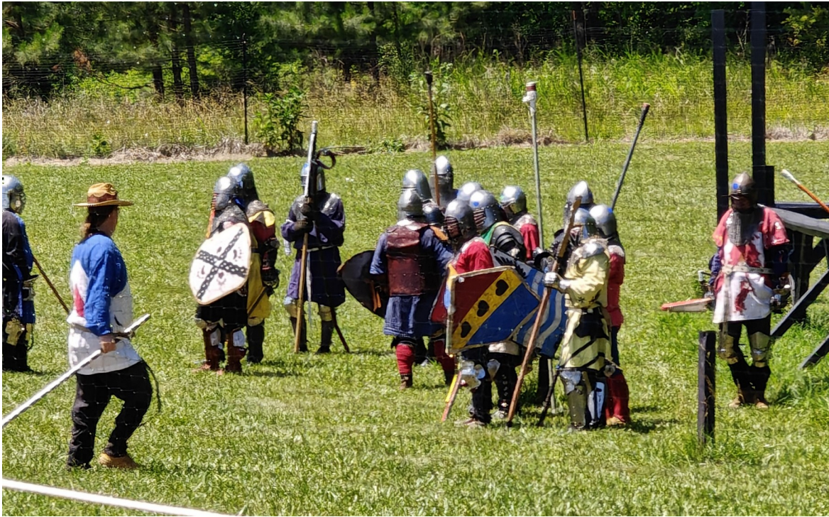
A pause in Armored fighting at 2026 Victory on the Vine.